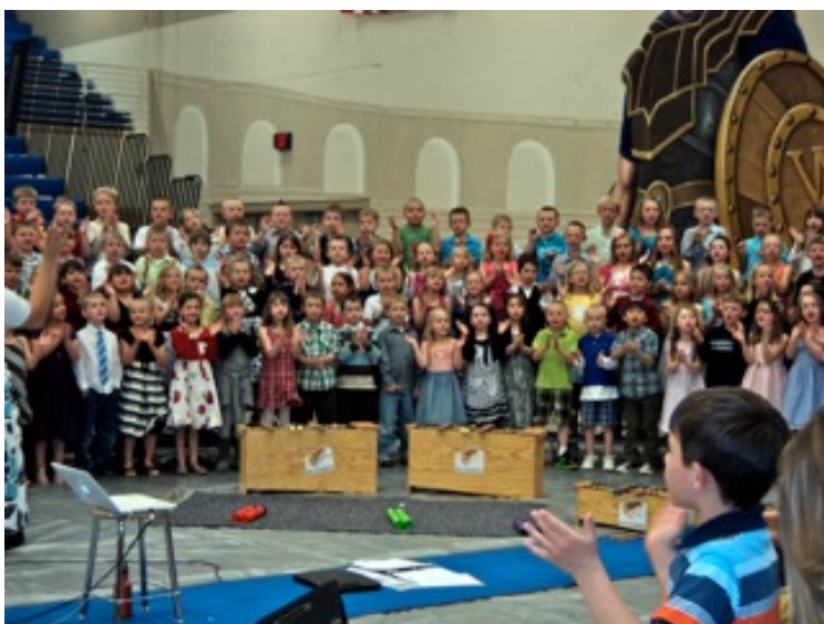
West Central Hartford Elementary Students clap as they sing the school song.

Following the concert, the WC PTA hosted a pie auction with each pie representing a different teacher. The PTA raised $316! Thanks for all who donated through this event.